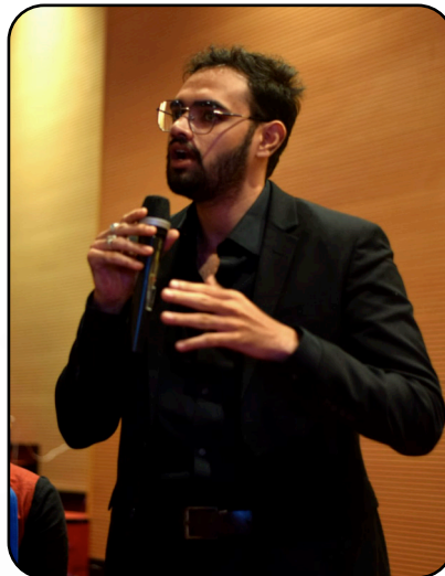
Final Year student presenting paper in Conference in Saveetha College of Law, Saveetha University, Chennai