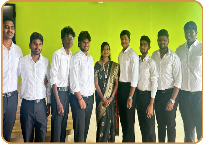
First Year students participating in International Conference held in KLEF College of Law