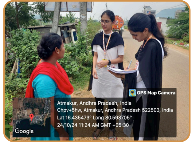
3rd Years students Collecting Data for Research in Atmakur Village, Guntur (dt)