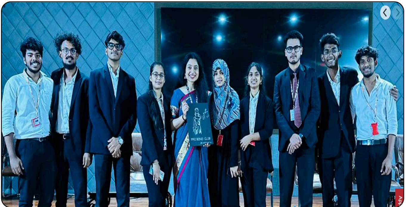
Pro Bono Club Ministry of Law and Justice, Government of India